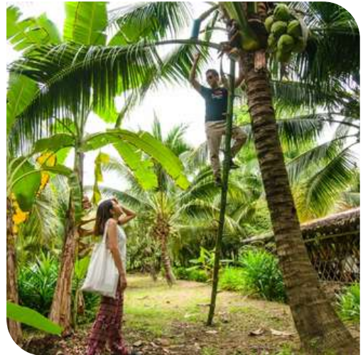
Salt Farm & Coconut farm