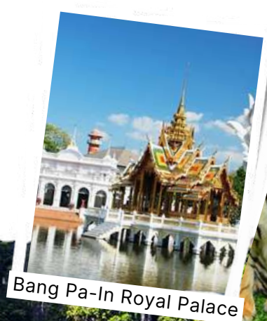
Bang Pa-In Royal Palace