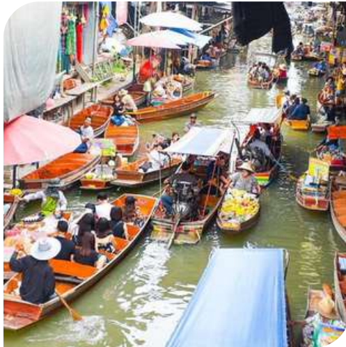
Damnernsaduak Floating Market